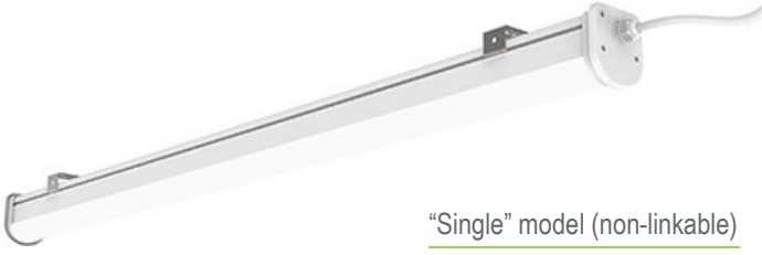
“Single” model (non-linkable)